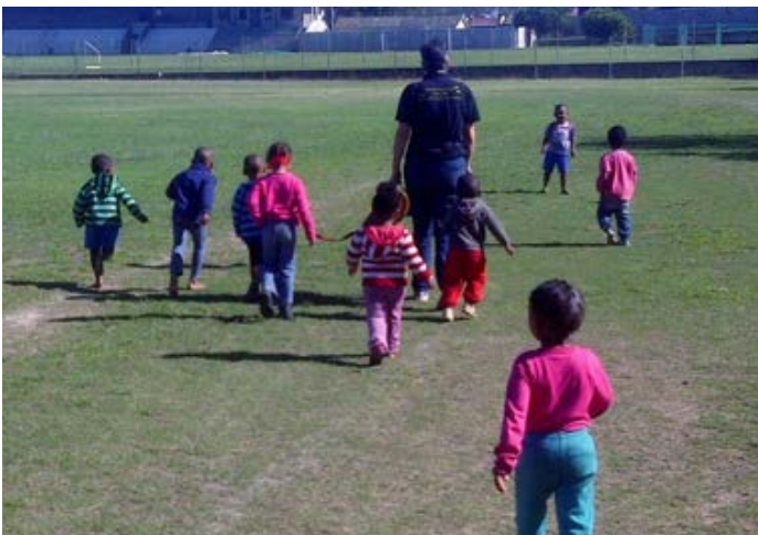
Almal stap saam!

Pikanini Speelgroep in Cloetesville gaan kuier. Die kleuters het opgewonde gewag vir die besoek van die Anna. Sommige was bang vir Anna terwyl ander opgewonde nader gestaan het. Die doel van die besoeke is om die kleuters meer te leer oor honde en wat die verantwoordelikhede rondom honde is. Die kleuters word geleer hoe om aan 'n vreemde hond te vat. Hulle het ook vir Anna geborsel. Die stappies met Anna was dan ook baie lekker vir hulle. Die kleuters leer ook meer omtrent verskillende soort honde en watter kleur die honde is.